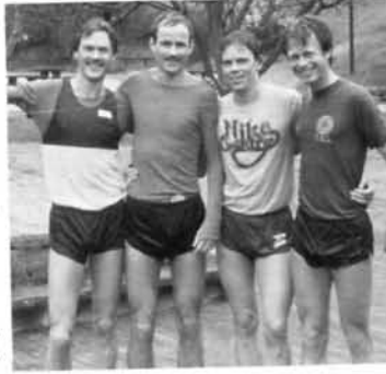
Left to Right, first thru fourth place at the Martinez to Port Costa Brickyard Run...all from Norway.